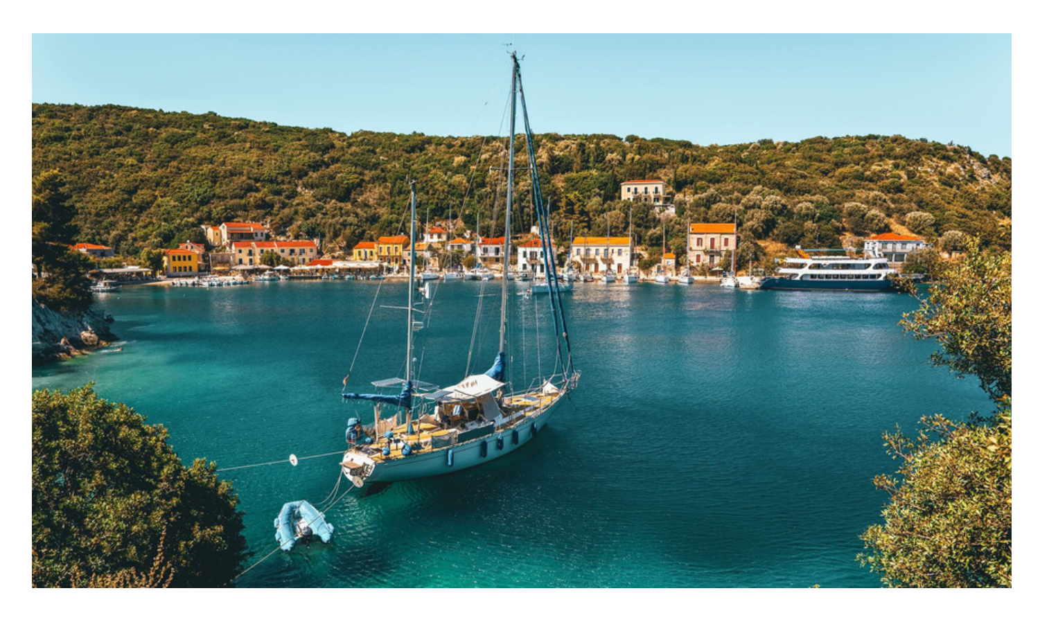
"When you set out on your journey to Ithaca, pray the road is long, full of adventure, full of knowledge."

- Excerpt from the poem "Ithaca" by Cavafy (1911)